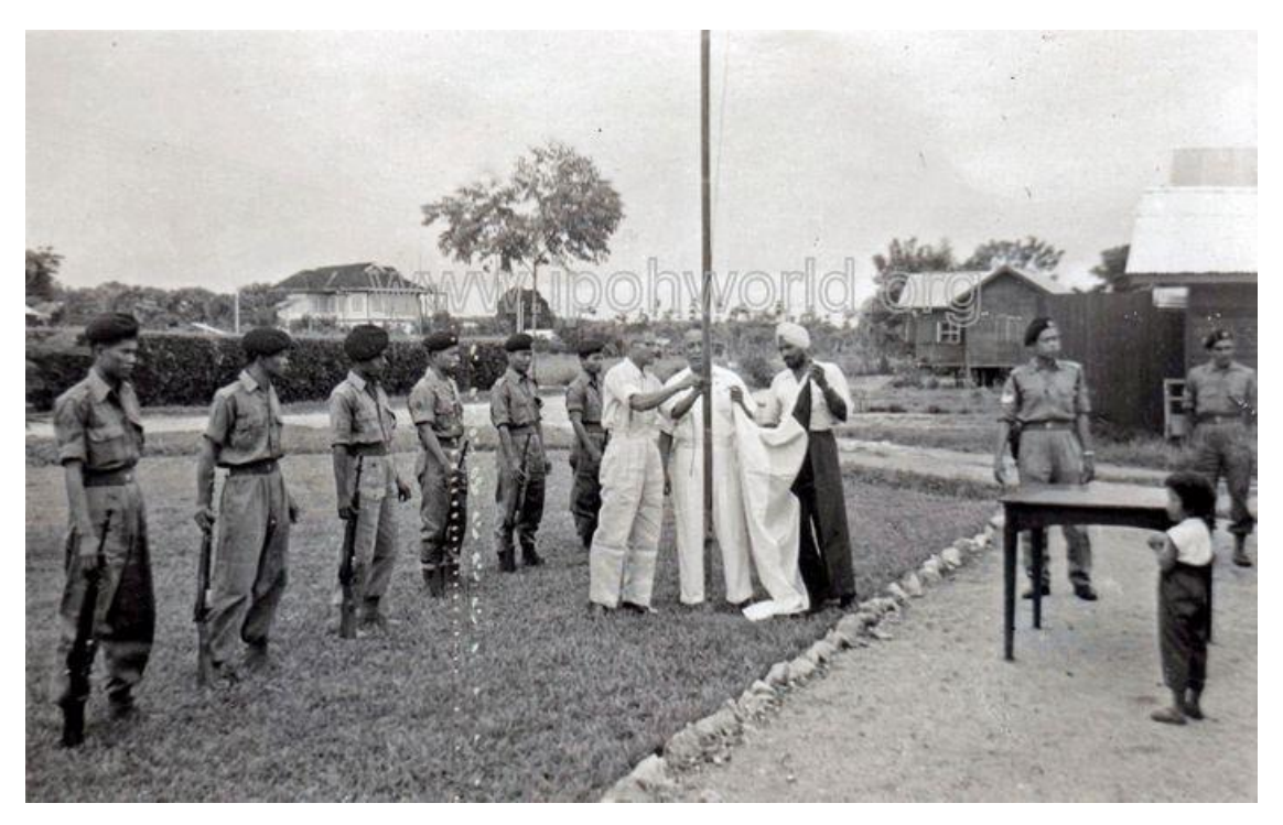
It's Merdeka at Kramat Tin

While Tunku Abdul Rahman was doing his famous Merdeka performance in the Stadium in Kuala Lumpur on 31 August 1957, literally thousands of small celebrations were taking place, in towns, villages, tin mines and plantations right across the peninsula. This was probably the greatest celebration in this country for all time. Not really surprising as this was that day that Malaya gained independence from its British Colonial Masters. The day the Federation of Malaya became a nation in its own right.