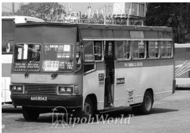
Ipoh Omnibus Company c1970

The idea of buses grew quickly and soon there were many different companies operating around Ipoh making it possible to travel to most of the towns in Perak. However, as most of these were independent operators, with only one or two vehicles and there was no coordination and as everyone vied for the most profitable routes, the public suffered.